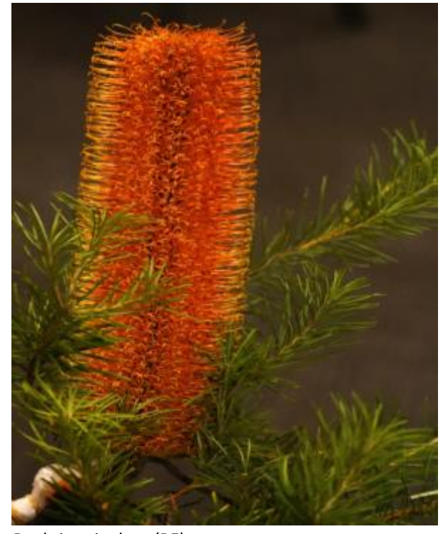
Banksia spinulosa (BE)