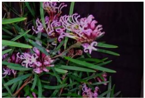
Grevillea sericea (DC)