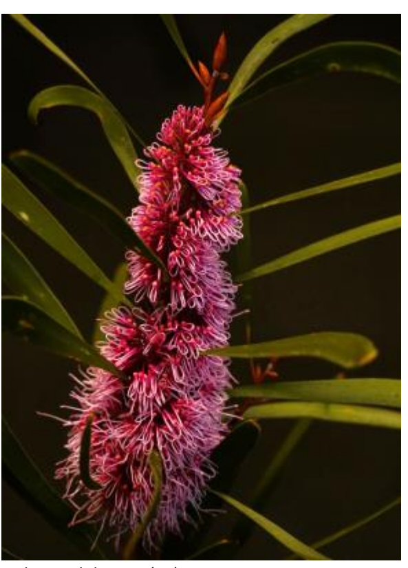
Hakea multilineata (BE)