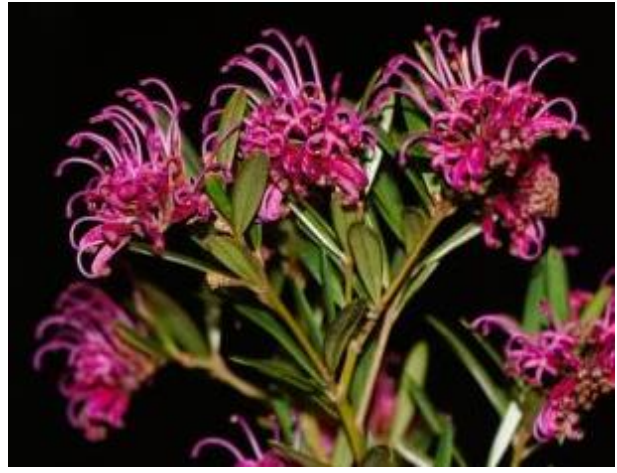
Grevillea "Collaroy Plateau" (self-seeded) (BE)