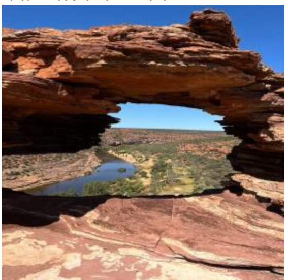
Nature's window – Kalbarri NP