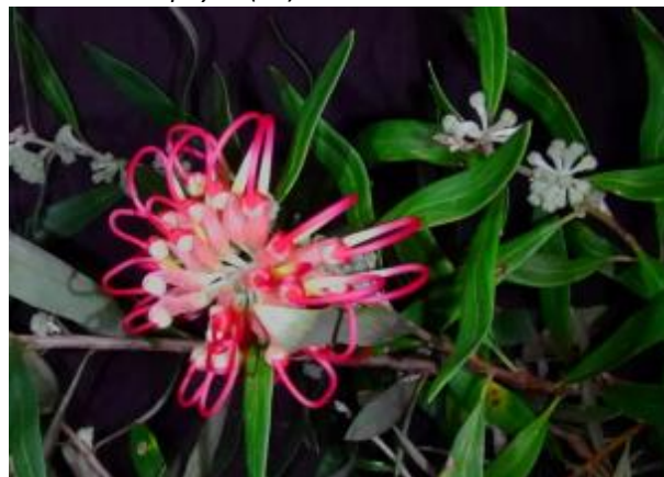
Grevillea olivacea (DC)