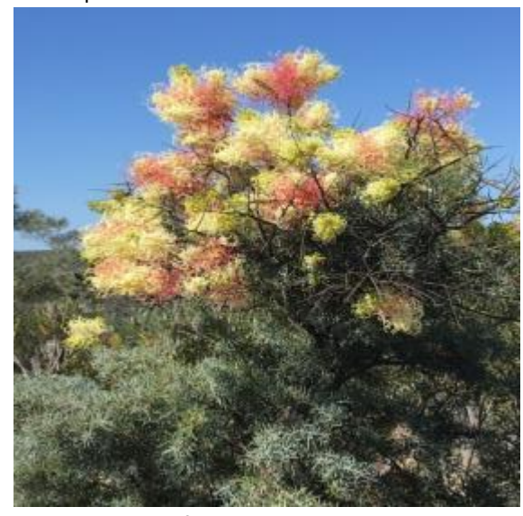
Grevillea annulifera – Prickly plume grevillea