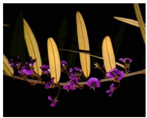
Hovea longifolia (BE)