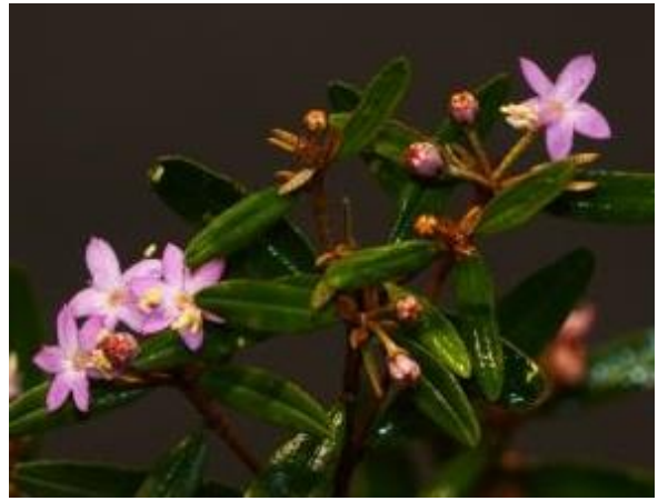
Phebalium woombye (BE)