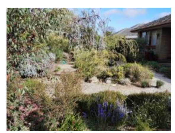
Front yard with "soak" in the middle

The idea of a soak seems to have benefitted some of the tricky showy species (plenty of sunshine and the occasional soak). Thelionema caespitosum (tufted blue lily) will provide colour later in the year. Kangaroo paws are newly planted under the eaves: it will be interesting to see how they go. Jill points out a richly coloured Grevillea depauperata (also known as G. brownii) nestled in amongst Hypocalymma linifolium.