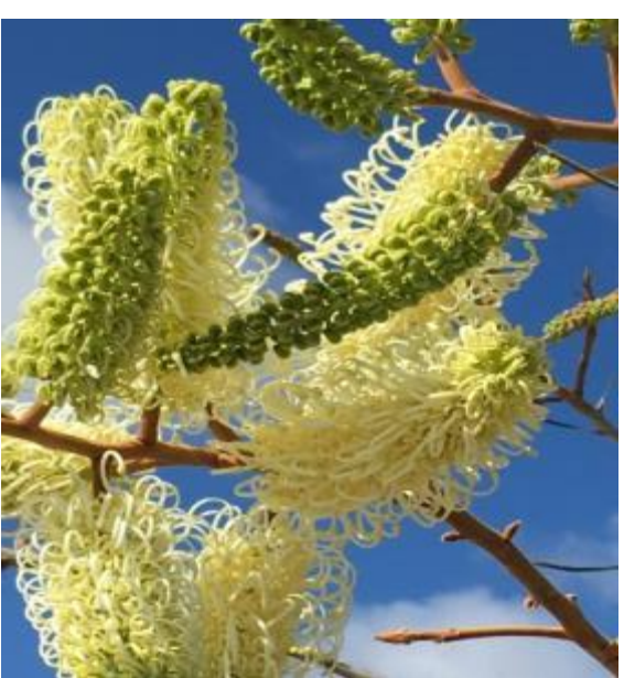
Close up of flowers of above