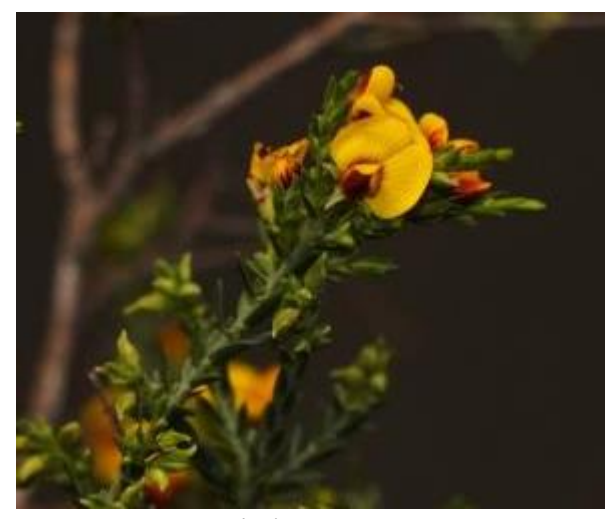
Eutaxia microphylla (BE)