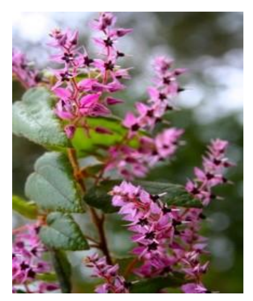
Lasiopetalum bracteatum

plantings, with climate change and fire being of great concern. With around 200 species this was turned into a book entitled 'Lantern Bushes of Australia' which was published last year by APS Keilor Plains.