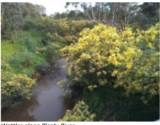
Wattles along Plenty River

Welcome to our July-August newsletter. Spring seems to have come early with blossom out and birds getting busy with their nests. The wattles are out along the Plenty River and Diamond Creek and look amazing.