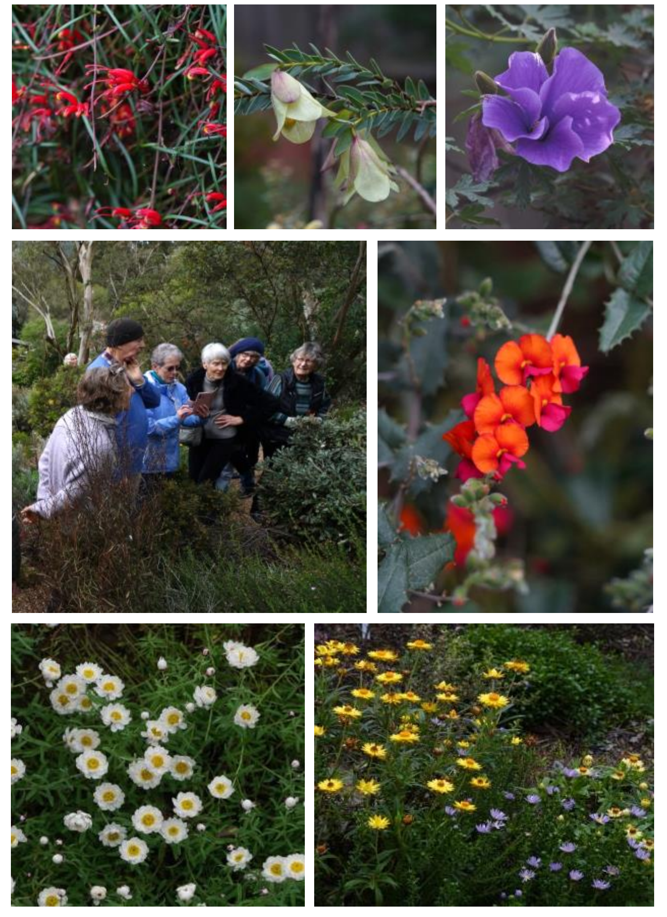
members with Ray, Chorizema varium, Rhodanthe anthemoides, Xerochrysum bracteatum with Olearia homolepis