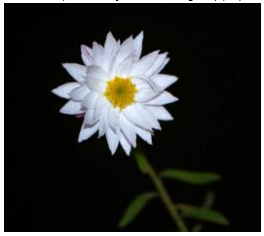
Rhodanthe anthemoides (BE)