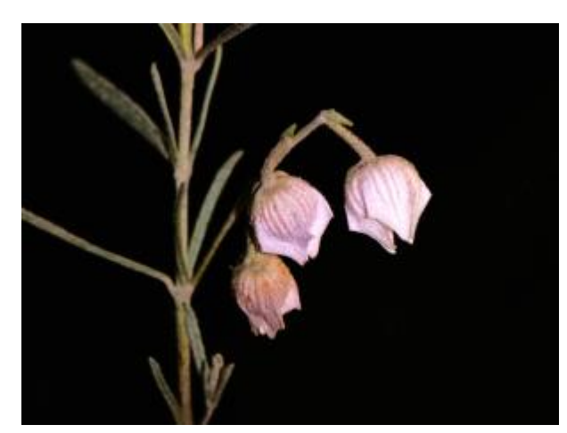
Guichenotia macrantha (BE)