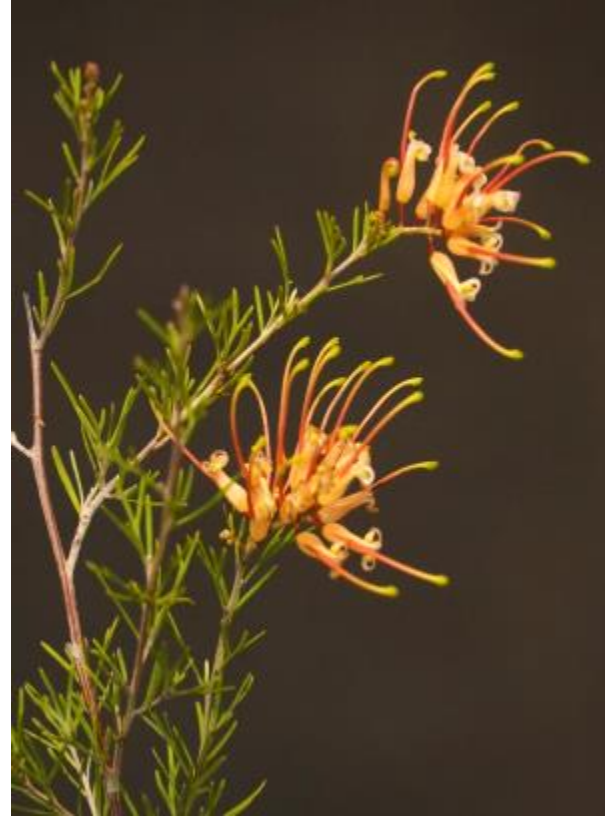
Grevillea semperflorens (BE)