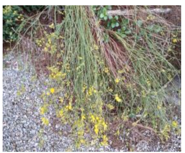
Acacia restiacea – fine-leaved form