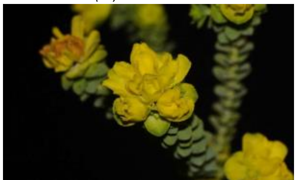
Geleznowia verrucosa (BE)