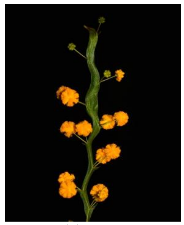
Acacia applanata (BE)