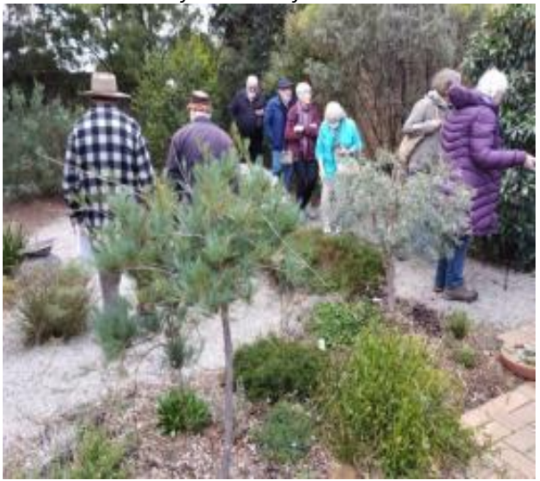
Members enjoying the garden