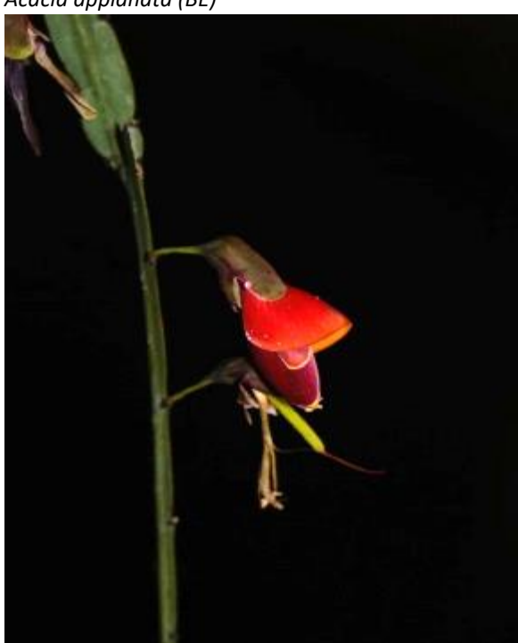
Bossiaea walkeri (BE)